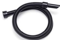
1.9 metre Vacuum Hose