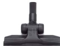
Dry pick up Nozzle