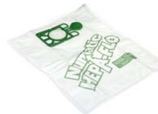
HEPA-FLO Dust Bags