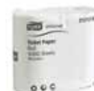
Tork Universal – White (4 packs)