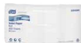
Tork Advanced – White (16 packs)