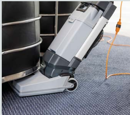
The SC100 needs just 25 cm clearance for cleaning.