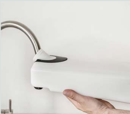
Easy to fill the solution tank with water in any low sink.