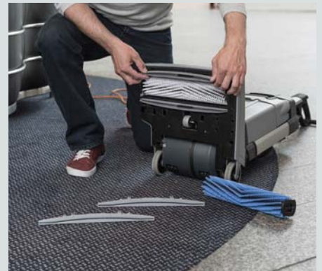
Apart from faster cleaning of hard floors, you can also freshen up smaller carpets, including removal of spots, by adding an optional carpet kit. Brush and squeegees can be removed without any tools, making daily maintenance operations easy and fast.